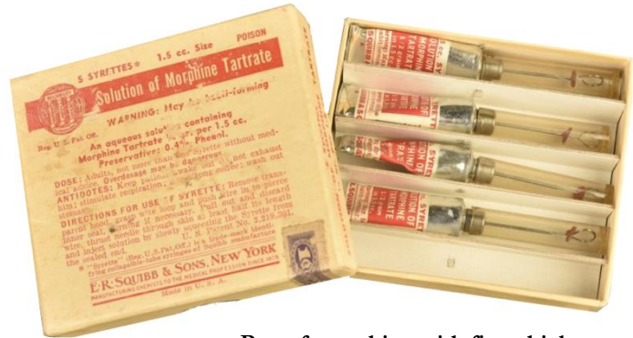
Box of morphine with five phials.

The U.S. Army had a carefully planned system to take care of their wounded soldiers. The first measures were taken by the medics, who were present on the battlefield.