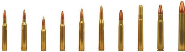
Different calibres of rifle ammunition

A bullet's calibre describes the diameter of the projectile.