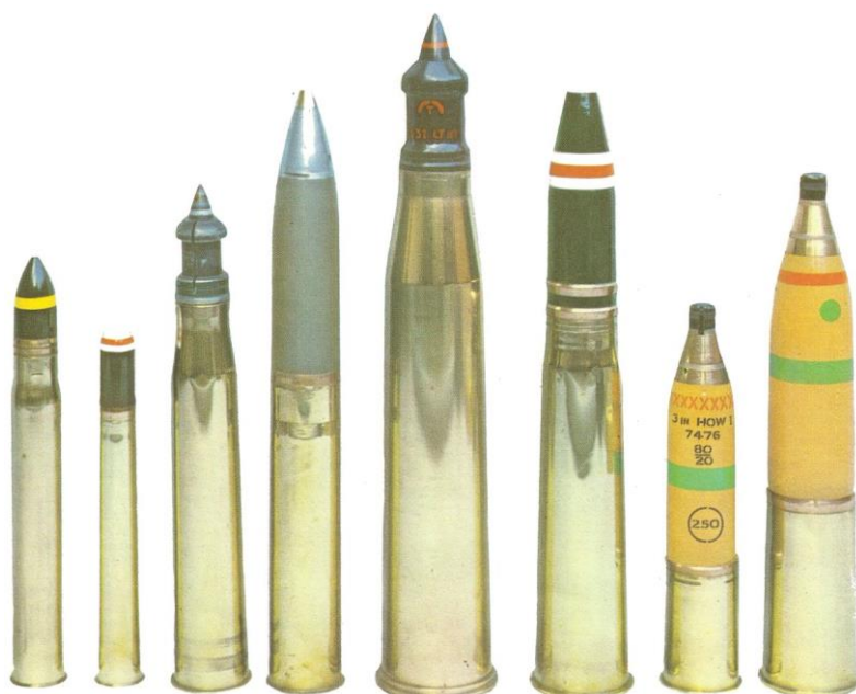
Different types of artillery shells.

Use the internet to find out what the different types of shells were used for.